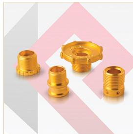
PARTS OF GAS VALVE