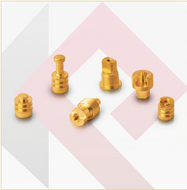
PARTS OF GAS VALVE