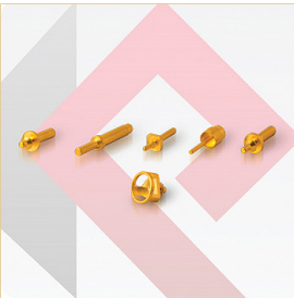
PARTS OF GAS VALVE