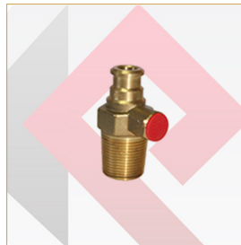
PARTS OF GAS VALVE