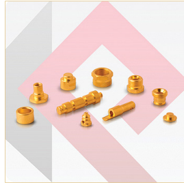
PARTS OF GAS VALVE