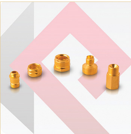
PARTS OF GAS VALVE