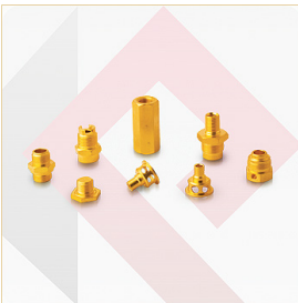
PARTS OF GAS VALVE