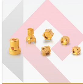
PARTS OF GAS VALVE