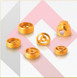
PARTS OF GAS VALVE