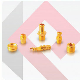
PARTS OF GAS VALVE