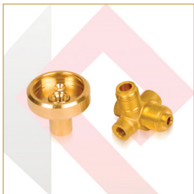
PRECISION AUTO PARTS