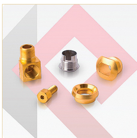
PRECISION AUTO PARTS