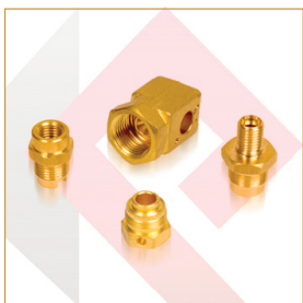
PRECISION AUTO PARTS