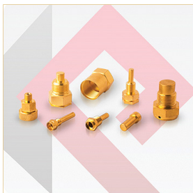
PRECISION AUTO PARTS